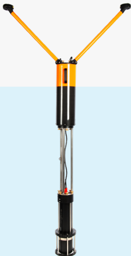
S2C 18/34 USBL Buoy

The USBL buoy is a fully integrated deployment-ready solution based on EvoLogics S2C USBL devices: